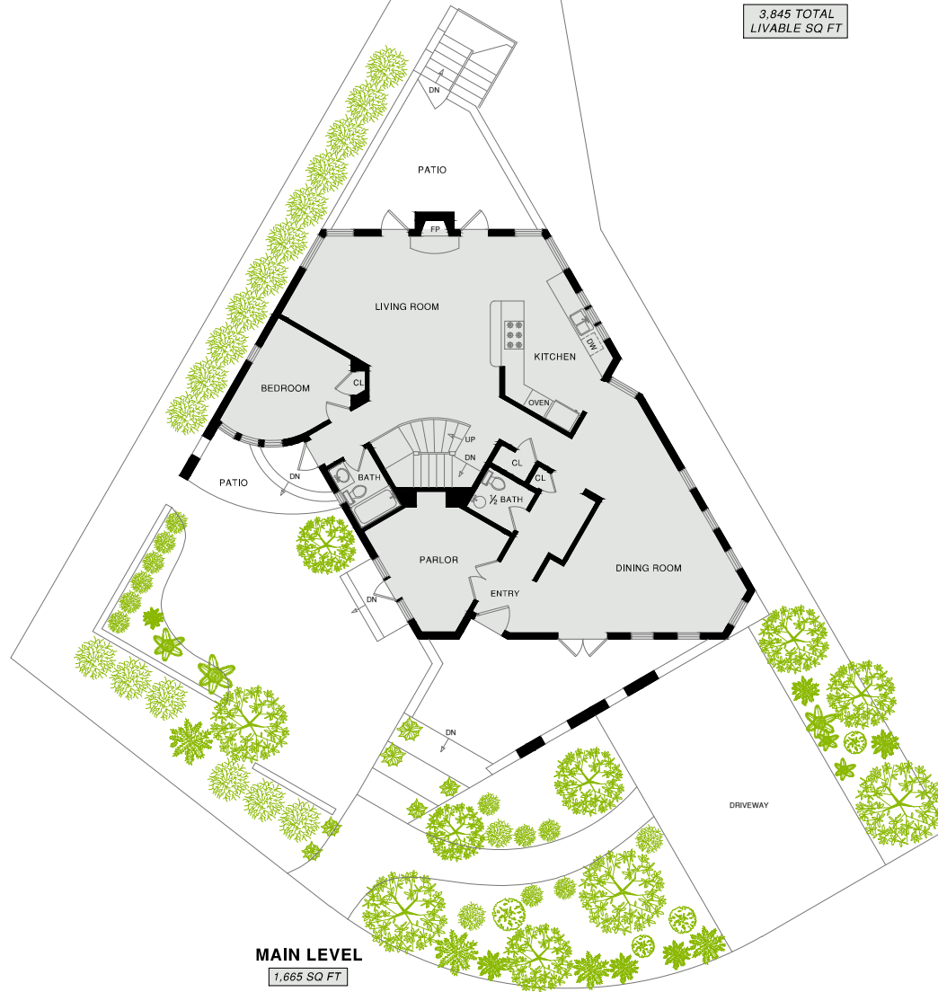
MAIN LEVEL 1,665 SQ FT